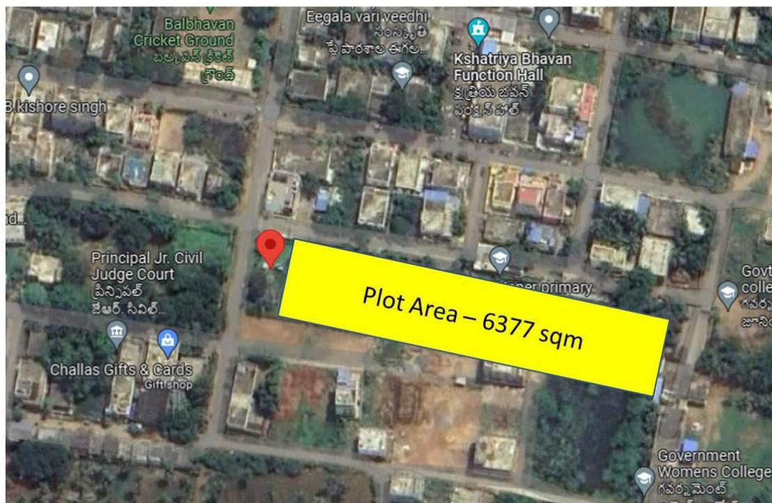
Location of Subject Site

The subject site is situated at 17°21'02.1"N 82°32'38.0"E in close proximity to educational institutions. The site can be accessed by 2 roads. The subject site is located and surrounded by residential colonies. Government Women's College and Upper primary school are near the subject site. A judicial Court is proposed to be developed opposite the site. The subject site is at a distance of approx. 3 Km from NH 16, approx. 4 Km from Tuni RTC Bus Complex, approx. 2.5 km from railway station and approximately 100 Kms from Rajahmundry Airport.